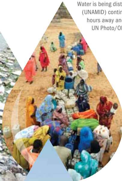
Water is being distributed by an African Union-United Nations Hybrid operation in Darfur (UNAMID) contingent from Rwanda in Tora, Northern Darfur. The closest water source is 1.5 hours away and donkeys are regularly used to transport water to the village (Sudan, 2009).