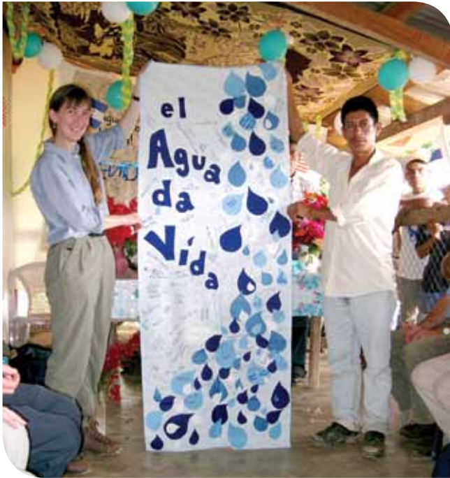
Water.org celebrating a project success, “El Agua da Vida” (Water is Life), in Honduras.

Ogallala Aquifer, but it is being drawn down far faster than nature can replenish it. Many of America’s largest cities have been built in the deserts of the American West, where water is a rare commodity.