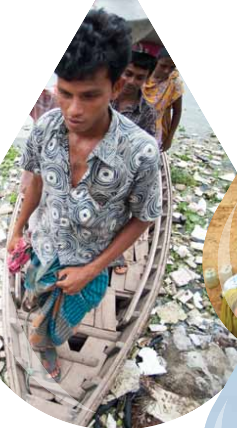
Top: Contaminated water in Karil slum, one of the urban slums of Dhaka. According to the World Health Organization (WHO), contaminated water is the cause of 5 million deaths every year. (Bangladesh, 2010).