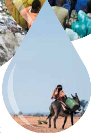
Right: Young girl from an Arab nomad tribe carries water through her village on a donkey (Sudan, 2008).

obtain subsistence amounts of leech- and feces-infested water. The new well delivers ample clean water for a monthly charge of 7 cents per household.